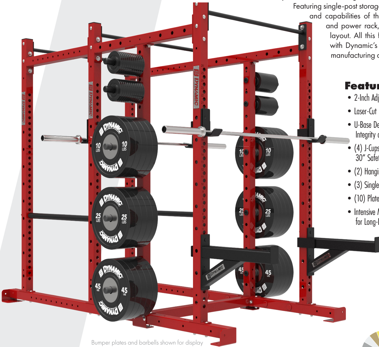
Bumper plates and barbells shown for display purposes only. Not included with unit.

Featuring single-post storage, It offers all the function and capabilities of the Titan Series half rack and power rack, while maximizing your layout. All this functionality is delivered with Dynamic's American-made quality manufacturing and design.