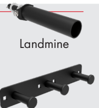
Bolt-on Band Pegs